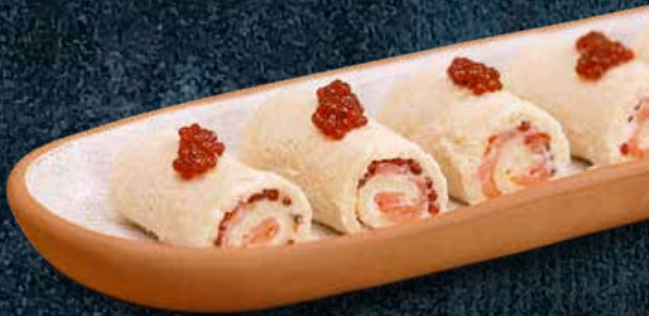
ROLLS WITH SALMON AND ANCHOVY SHIKRÁN® SPHERES Find more info & recipes at www.eurocaviar.es

The best anchovies from the Cantabrian Sea are transformed into spheres that not only preserve all their flavor, but improve it. Besides, they reduce their calories and sodium (salt) content.